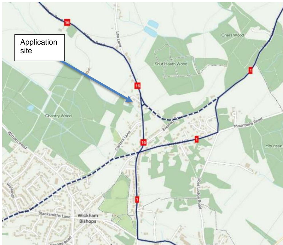
Map 1: Site location and Sustrans Cycle Route network

5.1.18 The site is more limited in terms of pedestrian access. The Pedestrian Isochrone in the Transport Statement illustrates the locations that can be reached on foot from the site within 10, 15 and 20 minutes and shows that the site is within 10 minute walk of bus stops in Kelvedon Road and within a 15 minute walk of local shops and facilities. The site is also within a 20 minute walk of Great Braxted Primary School. There are also bus stops on Kelvedon Road, approximately 500m from the site. However, there are no footways on Kelvedon Road therefore pedestrians would need to walk on the road itself or on the grass verge.