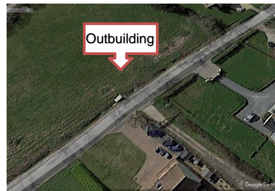
March 2022 Google Earth Image